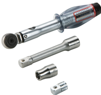
Toolset for KES-M